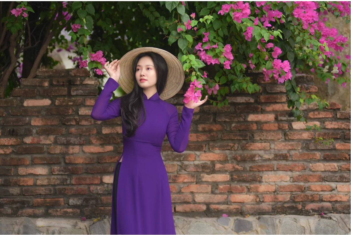
Thanks for your help! I looked online and I found this purple dress. I will wear it to Anna's party!