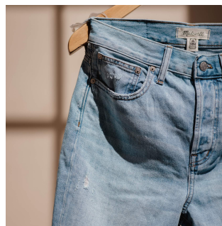
These are blue jeans.