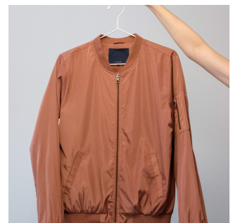
This is a brown jacket.