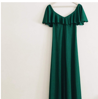
This is a green dress.