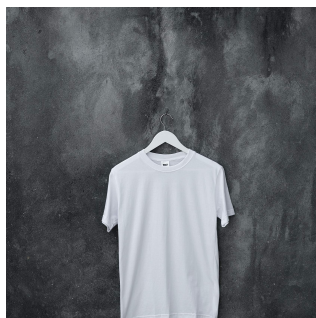
This is a white shirt.